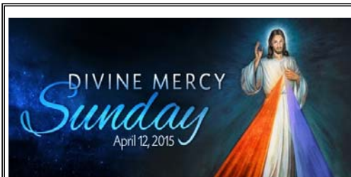
"Humanity will not find peace until it turns trustfully to divine mercy." (St. Faustina's Diary, p. 152)